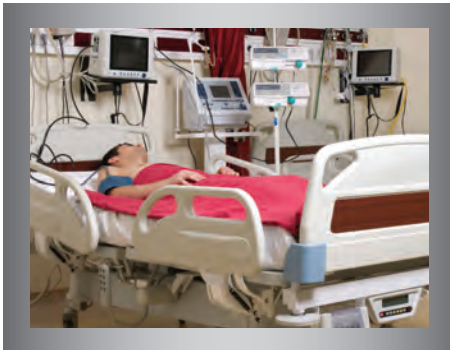
Medical-Grade (UL 60601-1 or UL 1363A) Power Strips Required